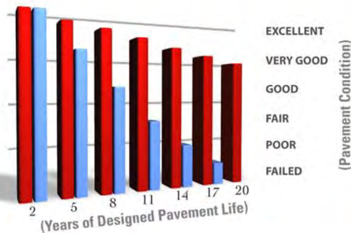
■ Scheduled Sealcoating ■ No Scheduled Sealcoating